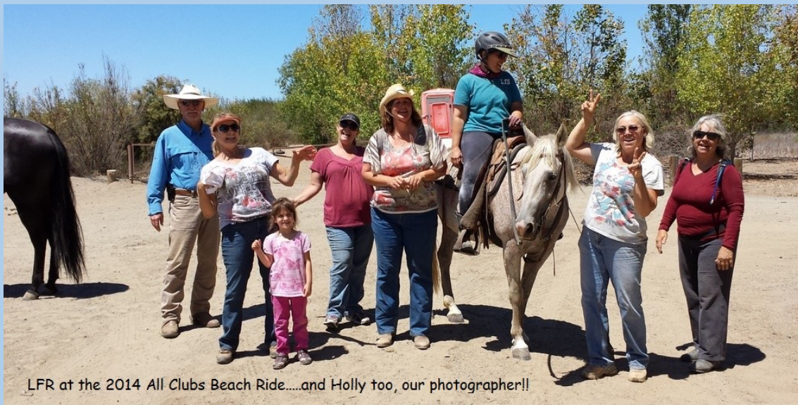
LFR at the 2014 All Clubs Beach Ride.....and Holly too, our photographer!!

February 13th to 16th, LFR President's Day Weekend Campout at Stagecoach RV Park. Make your reservations for your space and corrals NOW!!! Tell them you are with LFR. 760 765-3765, stagecoachrv@gmail.com .