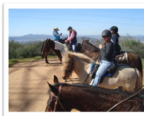
Above – Crestridge Reserve