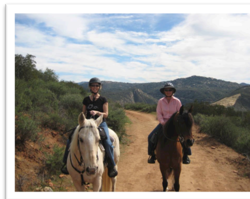
Above – Daley Ranch