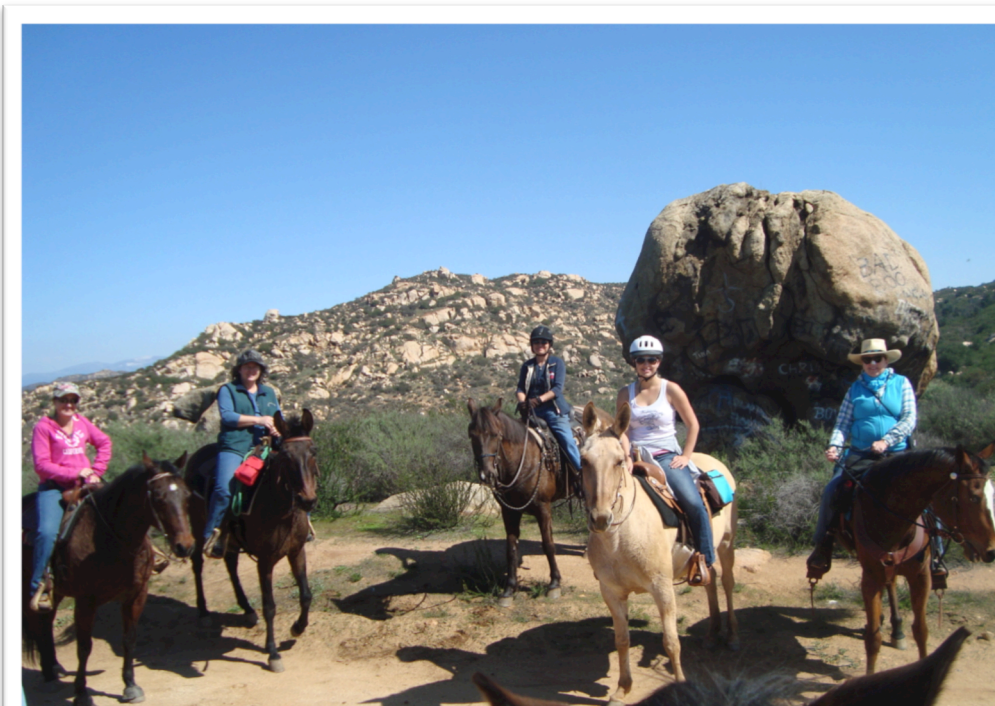
ABOVE: LFR MEMBERS RIDE CRESTRIDGE RESERVE, EL CAJON