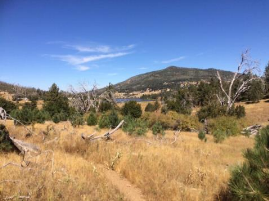
Los Vaqueros Horse Camp