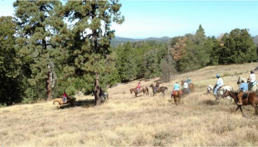
LFR club ride, Mt. Laguna